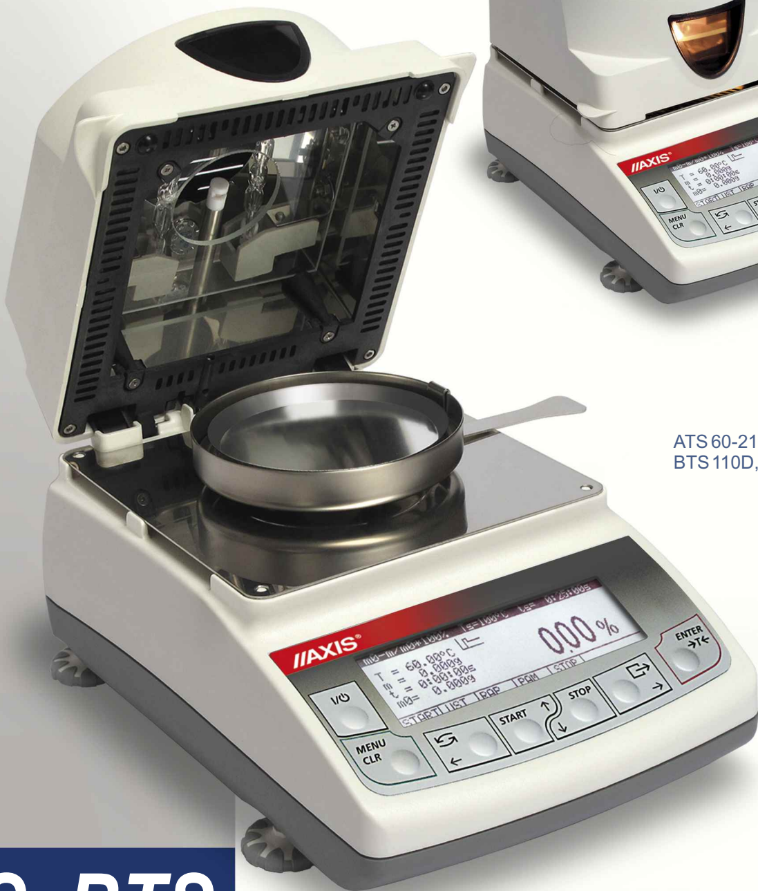
ATS 60-210 BTS 110D, BTS 110