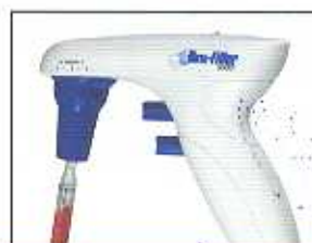
Position 2 — 7.5° Change

Use in the standard vertical position for basic benchtop uses.