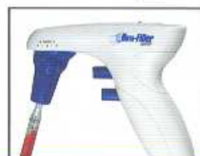
Position 3 — 15° Change

The smaller-angled position works well for tight benchtops with many bottles and flasks.