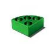
A00000230 Green AluBlock™, 4 pos. Ø28 x h 30mm