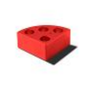
A00000232 Red AluBlock™, 4 pos. Ø21,6 x h 31,7 mm