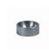
A00000258 Hemispheric bowl for 100 ml flasks