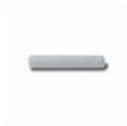
A00001056 Magnetic stir bar, 6x35 mm