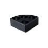
A00000231 Black AluBlock™, 4 pos. Ø28 x h 24mm