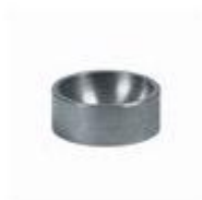
A00001071 Hemispheric bowl for 250 ml flasks