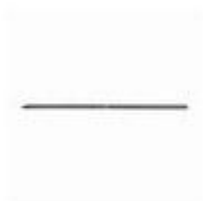
A00001069 Support rod