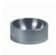
A00001072 Hemispheric bowl for 500 ml flasks