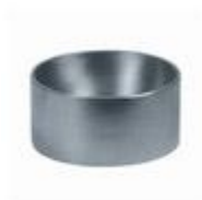
A00001073 Hemispheric bowl for 1000 ml flasks