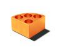
A00000229 Orange AluBlock™, 4 pos. Ø28 x h 43mm