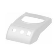
A00000284 Protective cover