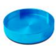
A00000228 AluBlock™ Base