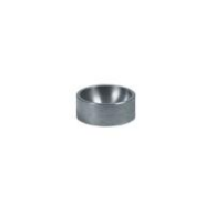
A00000273 Hemispheric bowl for 50 ml flasks