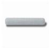
A00001061 Magnetic stir bar, 9,5x60 mm