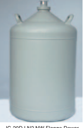
IC-20D LN2 NW Flange Dewar

For complete details on available accessories please see our Liquid Nitrogen Storage Dewar Accessories page.